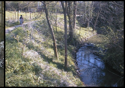
Hiking along theZwalm