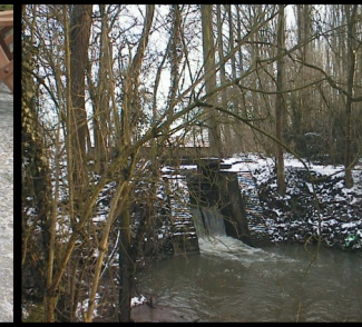
The levee of the Vanderlinders mill