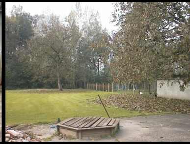
Autumn in our garden